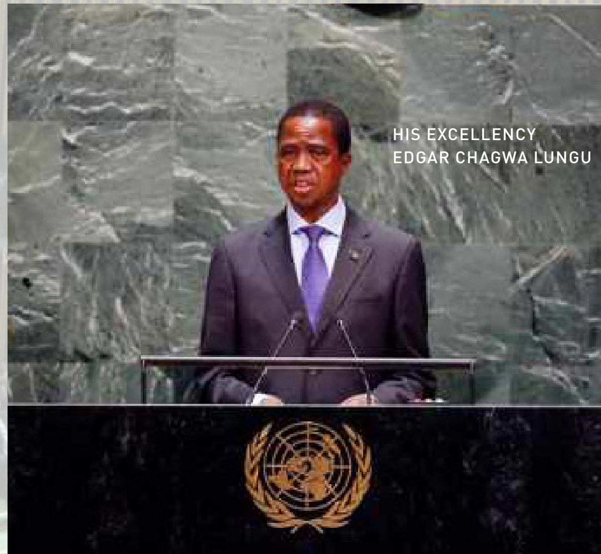
HIS EXCELLENCY EDGAR CHAGWA LUNGU